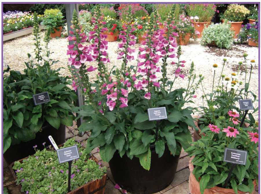
Digitalis Dalmatian Purple

We are very pleased to announce that we are now stockists of Stairway Trees, these are unique as they are grown using the Air-Pot. This system produces dense fibrous non-spiralling root system that are vastly superior to those grown in conventional containers and establish much quicker when planted. They would make a lovely specimen tree for your garden or a special gift. We can also order