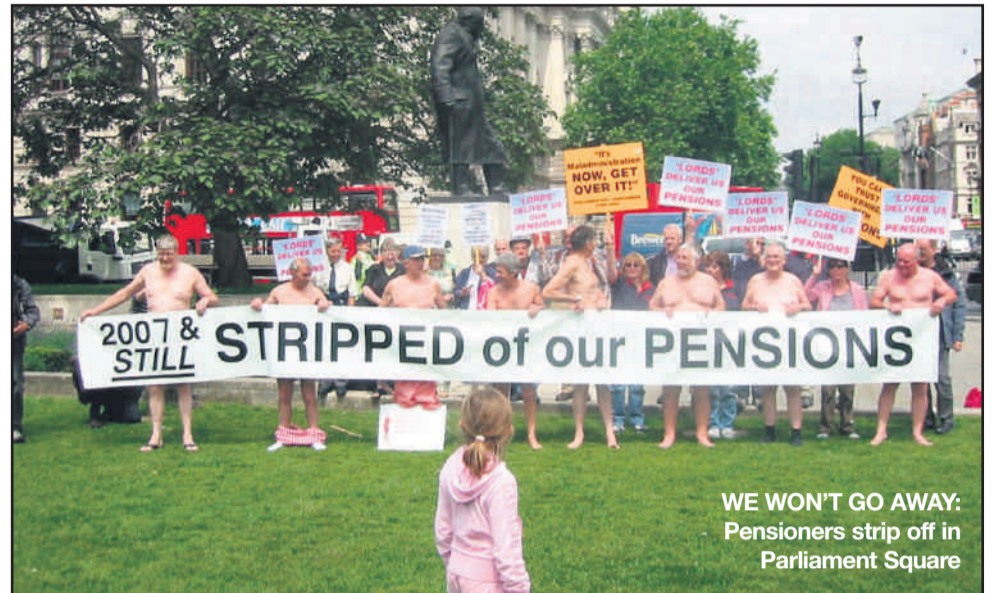
WE WON'T GO AWAY: Pensioners strip off in Parliament Square

But he now has to persuade local Labour MPs to vote in favour of the amendment when it comes before the Commons, probably next month.