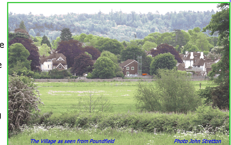
The Village as seen from Poundfield

The full response presented to the Parish Council is available via the web site, click on the blue banner at the following address. http://www.cookhamsociety.org.uk/