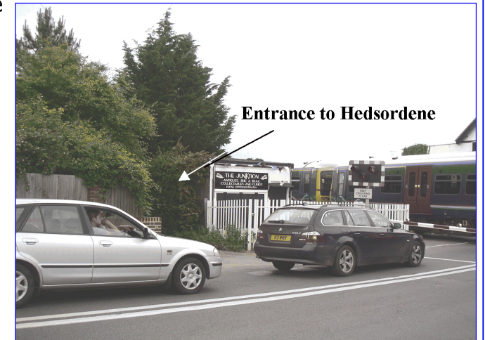
Entrance to Hedsordene

The Society believes that the infrastructure issues must be investigated and satisfactorily addressed prior to any application being considered. The very real safety and access concerns expressed by residents need further investigation. Only then, could minimal minor development be considered.