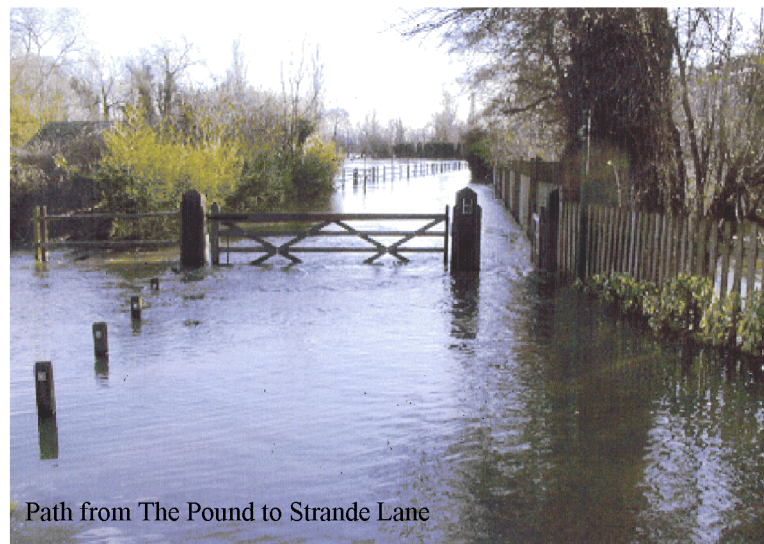
Path from The Pound to Strande Lane

Despite the fact that the Parish Council raised no objection to minor amendments to the February planning application made by the EA, the Borough has yet to approve this application. The point of this application was to restore the risk of flooding in South Cookham to the same level as prior to the creation of the Jubilee River and the Maidenhead Bund. As reported at the AGM, the capacity of the Jubilee River has been increased and the sills in Odney Weir lowered so that surplus water moves away more quickly.