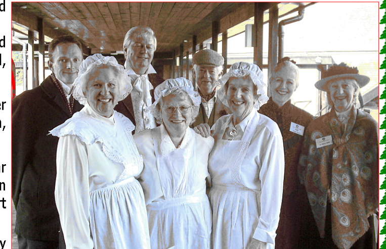
Christmas Fayre 2005

Please put this date in your diary as the Fayre will be a "not to be missed" occasion for the whole family.