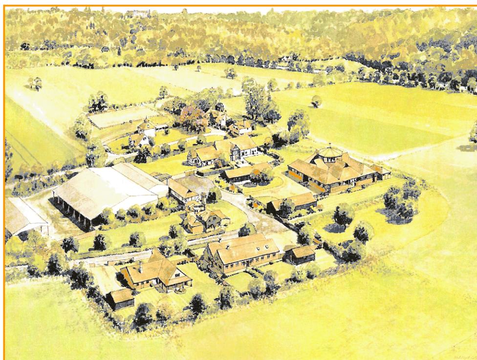
Artist's impression of the finished site

The agents, Cluttons, have now let us have an early view of the completed plans so that we may comment on them.