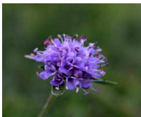
Clockwise from top right Ivy bees, Devils bit scabious, Pyrausta Aurata micro moth and Kingfisher with food