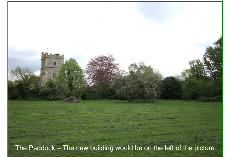
The Paddock – The new building would be on the left of the picture

Two alternatives were offered for public consultation: (1) the erection of a new Centre in the Paddock (the field between the existing Parish Centre and the river) on a site due west of the church, or (2) construction of a new building in the present car park behind the Parish Centre. Both projects would be financed by the conversion of the Parish Centre into apartments of which 3 would be sold.