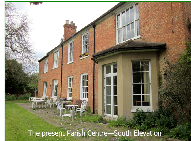
The present Parish Centre—South Elevation

The Society has expressed its reservations to the Parochial Church Council over its proposals to construct a new Parish Community Centre on a choice of sites near Holy Trinity Church. Although the Society recognises the proposals are only part of an initial consultation programme, it considers there are significant issues which need to be resolved before the scheme progresses much further.