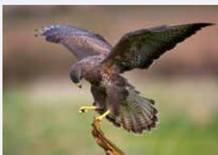
Buzzard balancing, courtesy of Gordon Langsbury

The bubbling calls of Teal on these ephemeral pools reveal genuinely wild birds, birthed in such places as the Altai Mountains, seeking refuge before returning east to breed.