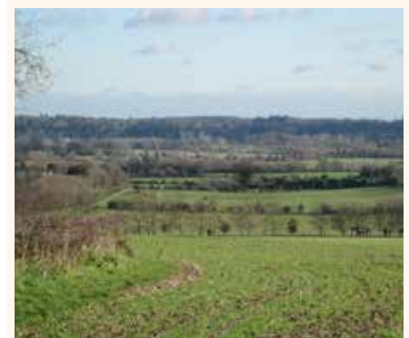
View towards Lower Mount Farm, by Tom Denniford

We are delighted that the openness of the Green Belt has been protected.