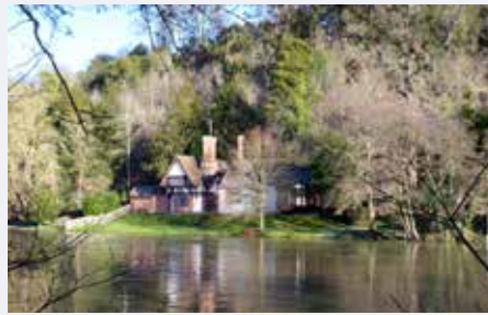
Spring Cottage from the Thames towpath, made infamous by the Profumo scandal

family and the Profumo scandal of the 60s. Its position adjoining the towing path provides an opportunity for walkers to take advantage of the footpath network between Maidenhead and Cookham.