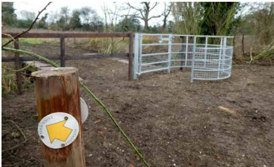
Strand Bridge Gate

land-owner, (Summerleaze), has now installed a gate adjacent to the bridge and re-opened this track this as a Permissive Path. To ensure that this route is never blocked again, the Society is supporting a claim to have the link formally declared a Right of Way.