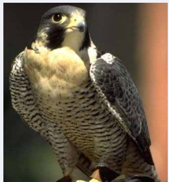
Peregrine

already been recorded. Do take a stroll sometime to take in this amazing avian haven.