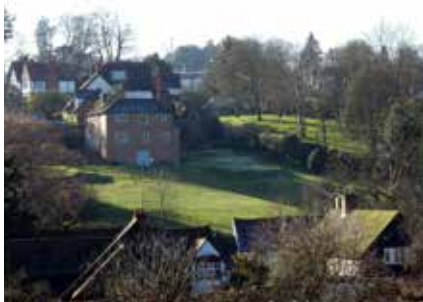
April Dene

If its character is to be protected, infilling and division of plots is to be firmly resisted. In 2017, we opposed an application in Job's Lane to subdivide the plot and turn it into