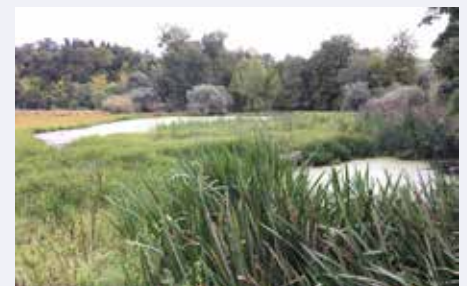
East Field, by Barry Weare

years, it now provides a habitat for a wide range of species, some of which are protected. From the Society's point of view the White Brook and the land adjacent to it are important, as part of the means by which water is returned to the Thames during floods and we would not wish to see this diminished. But the land is also an important additional area of public access in this part of the borough and it must be possible for an accommodation to be reached between nature conservation and public enjoyment.