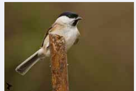
Marsh Tit

With the numerous resident species we are familiar with, some 75 species of bird have