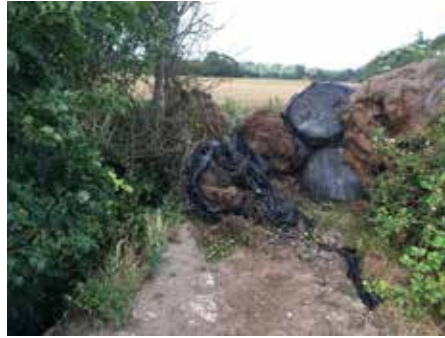
Blocked Strand Bridge

Last summer, it was unexpectedly blocked by the new farmer taking over the management of the land. Following representations from the Cookham Society, the