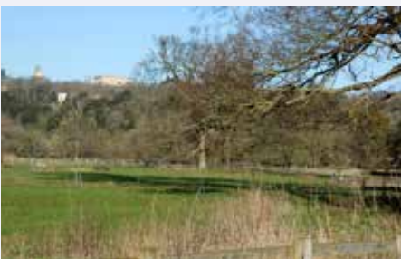
Cliveden from Battlemead

Our photos show its attractive location, with its views across the river up towards Cliveden with its historic associations with the Astor