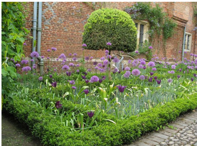
Alliums underplanted with tulips at Grey's Court.