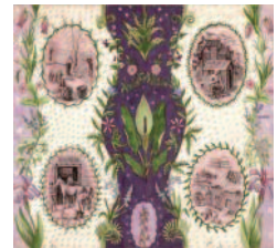
Festival of Britain 1951

An 1863 directory reported that 'the whole of Maidenhead and its neighbouring villages are employed in agriculture, and in making boots and shoes which are manufactured here in considerable numbers'.