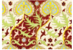
Pugin textile design 1850

See the archive and the Textiles and Craft exhibition in the new Heritage Centre (see page 21).